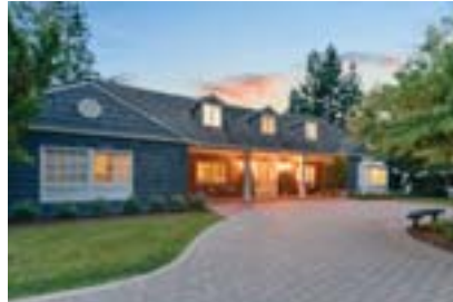
JULIE DEL SANTO/ANGIE CLAY