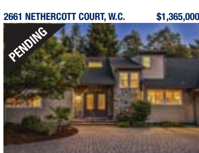
2661 NETHERCOTT COURT, W.C.