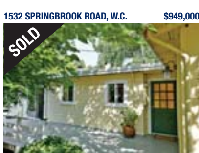
1532 SPRINGBROOK ROAD, W.C.