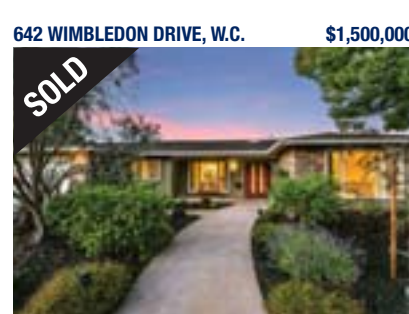
642 WIMBLEDON DRIVE, W.C.