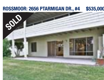
ROSSMOOR: 2656 PTARMIGAN DR., #4