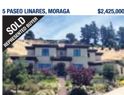
5 PASEO LINARES, MORAGA