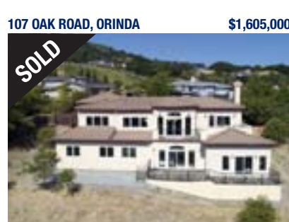
107 OAK ROAD, ORINDA