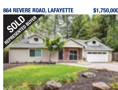
ROSSMOOR: 1160 ROCKLEDGE LN., #12