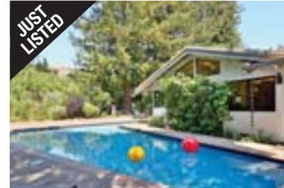
DUDUM REAL ESTATE GROUP